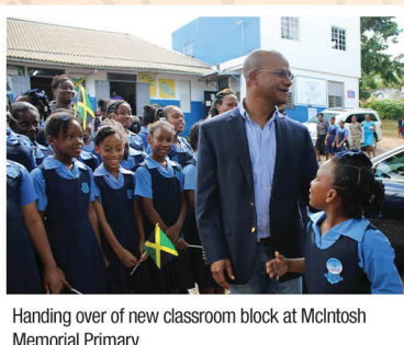
Handing over of new classroom block at McIntosh Memorial Primary