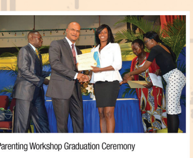
Parenting Workshop Graduation Ceremony

An appreciation raffle was held in honour of the taxi drivers in Central Manchester. Prizes included: $50,000 JMD, tires, gas vouchers, tool kit and air filter/oil filter.