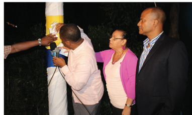
Residents of Low Street, Bellefield Division received electricity for the first time

The Bull Dead & Frederick Piece Roads have been rehabilitated under a Farm Road Programme.