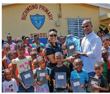
Richmond Primary School children receiving their back to school supplies from Flow

A donation of trophies and medals was made to Porus Primary, Richmond Primary and the Bishop Gibson High School for their retiree function.