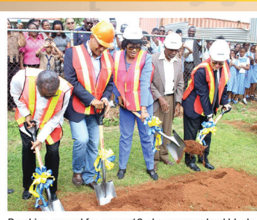
Breaking ground for a new 12-classroom school block at Mandeville Primary and Junior High School