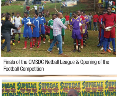
Finals of the CMSDC Netball League & Opening of the Football Competition

For the first time, we had the Hanbury & Police Football Competition under the lights at Hanbury Field. Congrats to Hanbury!