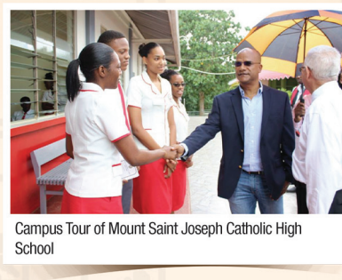
Campus Tour of Mount Saint Joseph Catholic High School