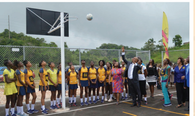
May Day High School Multipurpose Court