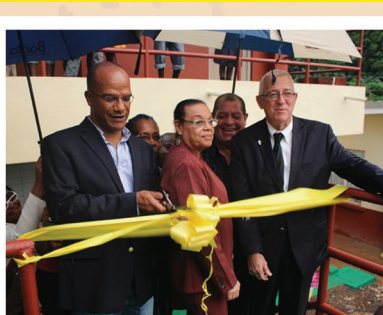
Opening and Handing Over ceremony of new school building at Zion Hill Primary