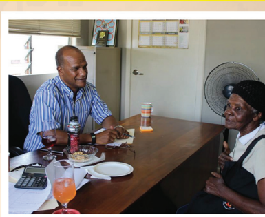
Office Day #FridayInCentralManchester