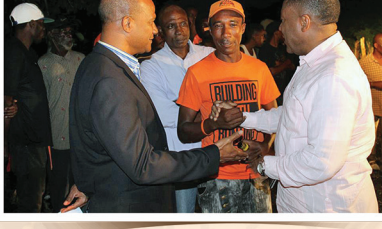
Rehabilitation of the Bullethead Road.