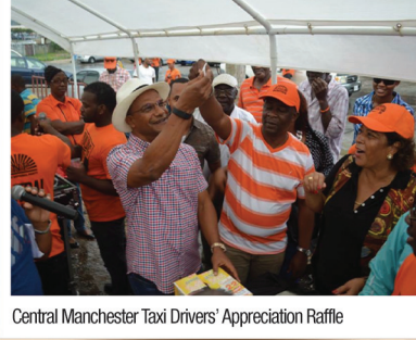
Central Manchester Taxi Drivers' Appreciation Raffle

Parenting workshops were held for 174 participants in the communities of Comfort, Greyground, Richmond and Bellefield.